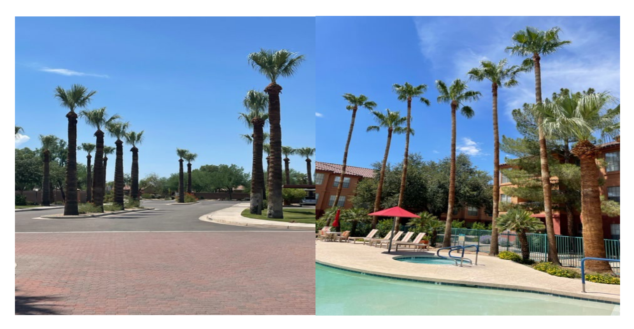
The Palms allocated to be trimmed and skinned has been completed.